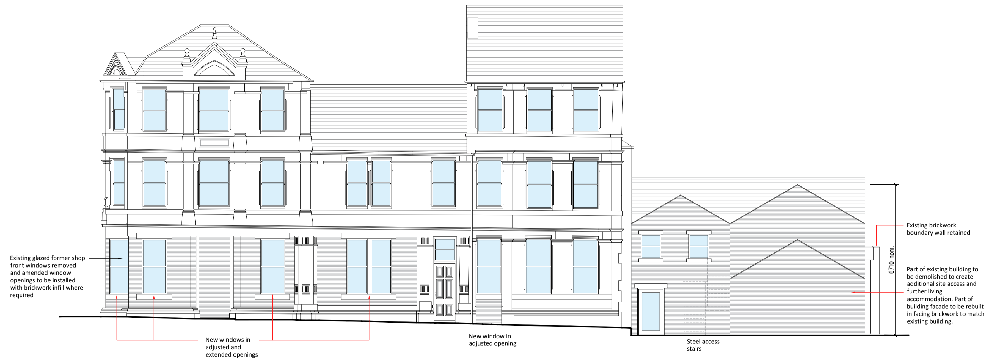
Front Elevation as Proposed Scale @ 1 : 100

Note: Studio OL3 Ltd shall have no responsibility for any use made of this document other than for that which it was prepared and issued. All dimensions and levels to be checked on site. Any discrepancies should be reported to Studio OL3 Ltd. This drawing should not be reproduced without written permission from Studio OL3 Ltd.